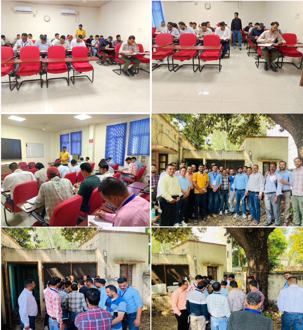
Exam & Retrofitting site Visit

As part of the evaluation process, an assignment was conducted for the participants to assess their practical understanding of the training. The exercise involved preparing a hand-sketched drawing of a building with appropriate dimensions, along with stress mapping to identify critical structural zones. Participants were also required to analyze and highlight existing issues or shortcomings in the structure and propose suitable rectification measures and improvements. This assessment aimed to evaluate their ability to apply theoretical knowledge to real-world scenarios.