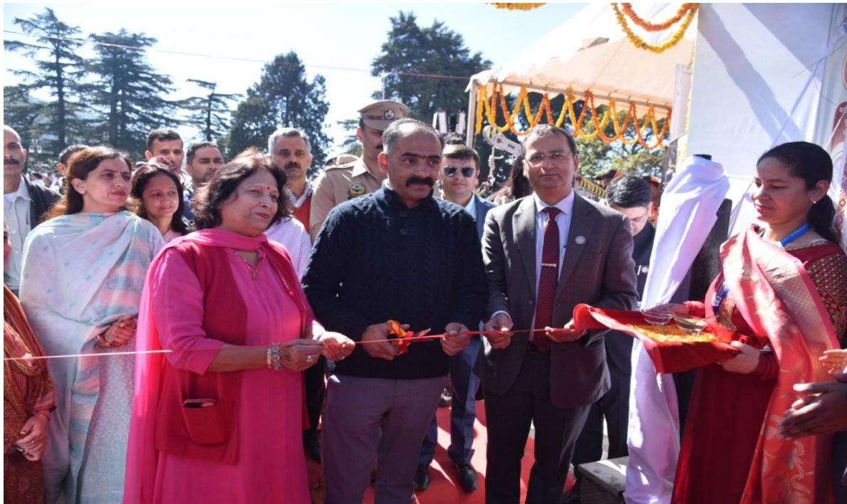
Inauguration of the 4 Days Exhibition by Sh. Anirudh Singh, Hon'ble Minister, Rural Development and Panchayati Raj, Himachal Pradesh